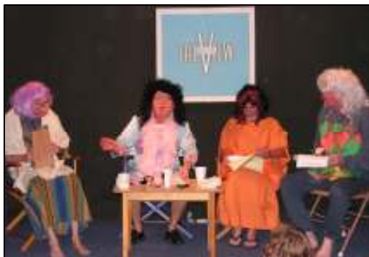
Bible Story- telling Night 2011

Feel free to invite a neighbor or friend who would enjoy a fun evening of Bible stories. This is a multi-generational event, everyone is welcome.